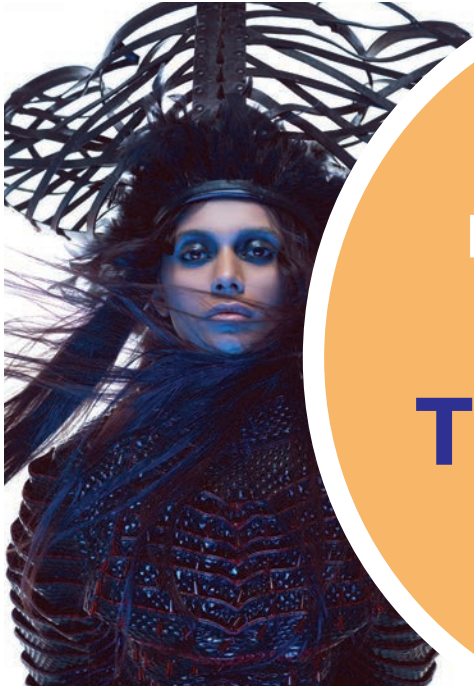
High end Fashion